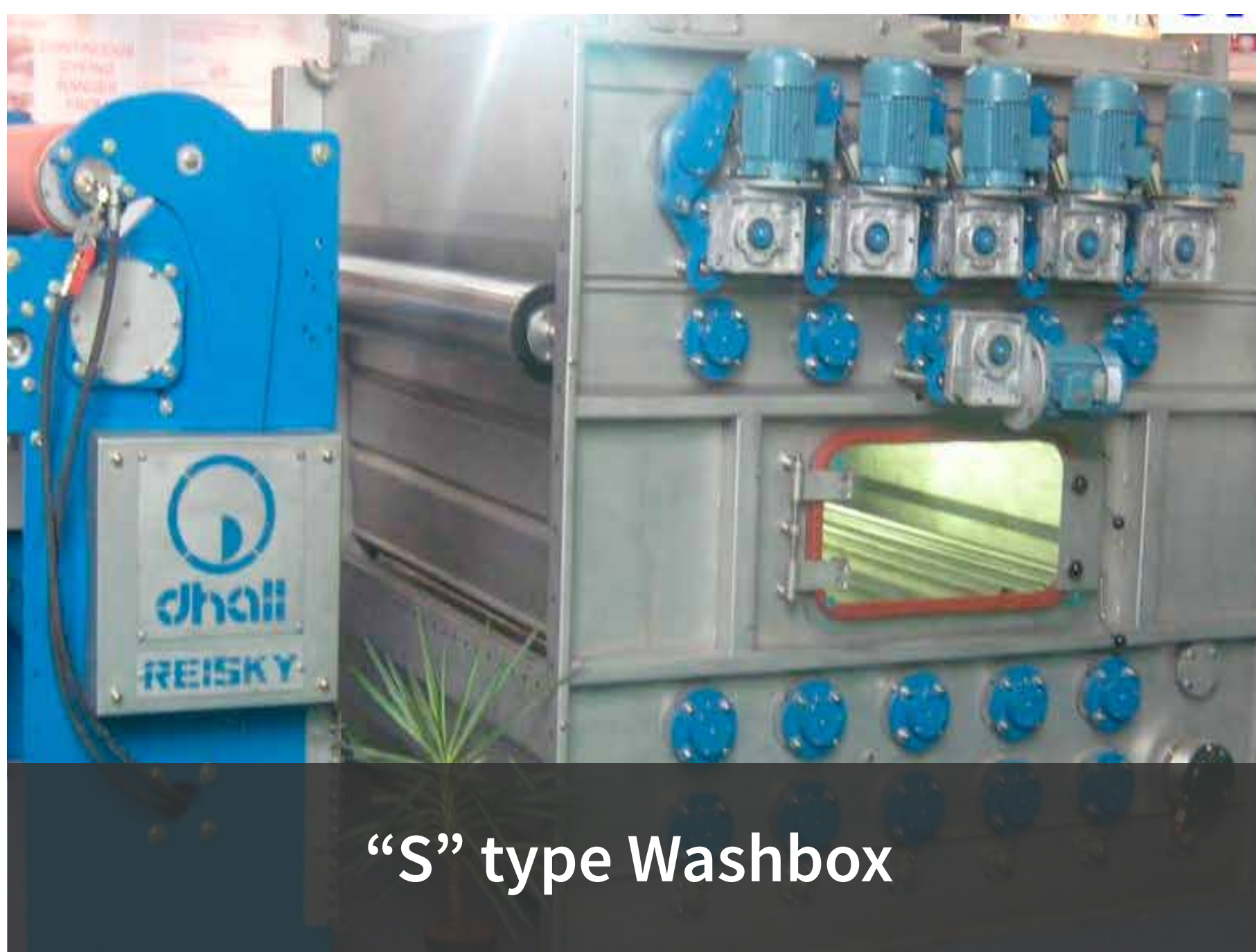
"S" type Washbox