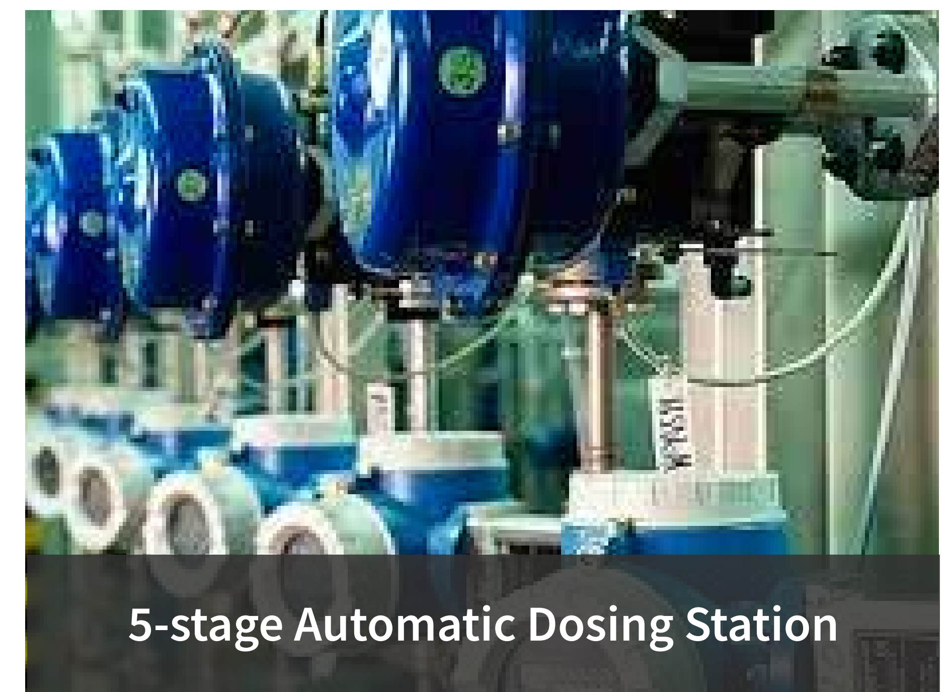
5-stage Automatic Dosing Station

Over 2,000 satisfied customers across 30 countries, including: