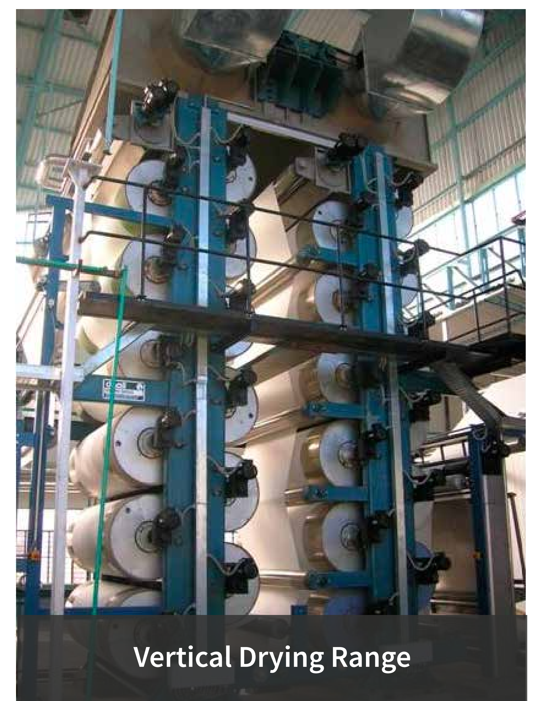
Vertical Drying Range